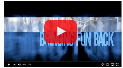
North Carolina College Tour Weekend Recap Video - Rated FUN