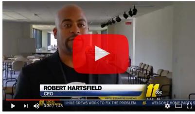
ABC11 SpokeHub News Clip